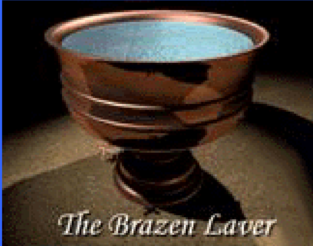
The Brazen Laver